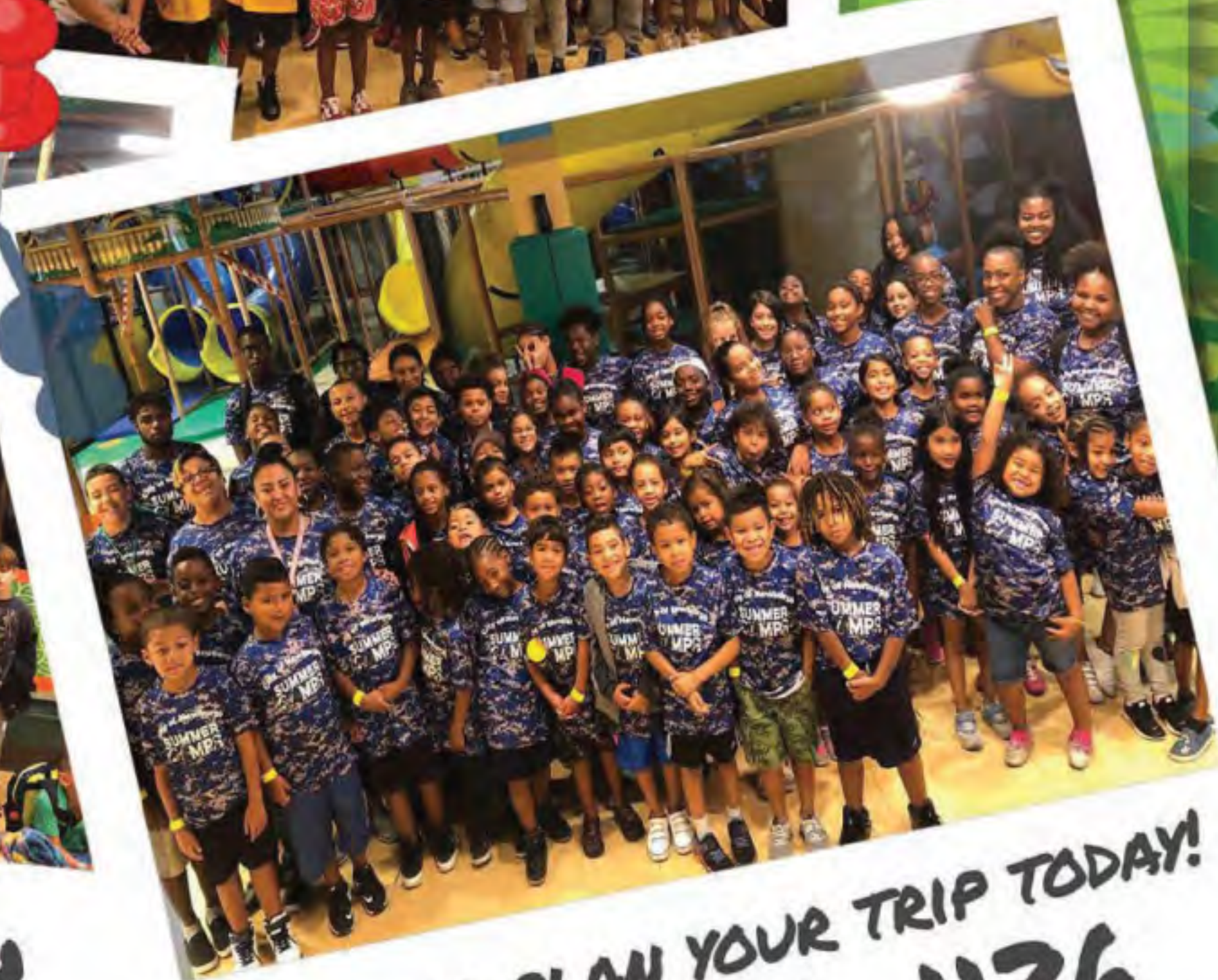
CALL TO PLAN YOUR TRIP TODAY! 347-640-1126