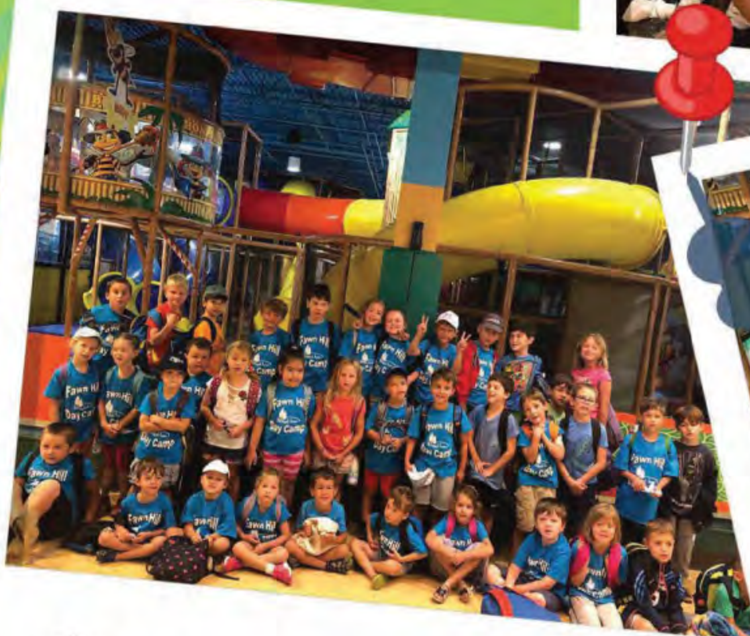
CLASS OF '18