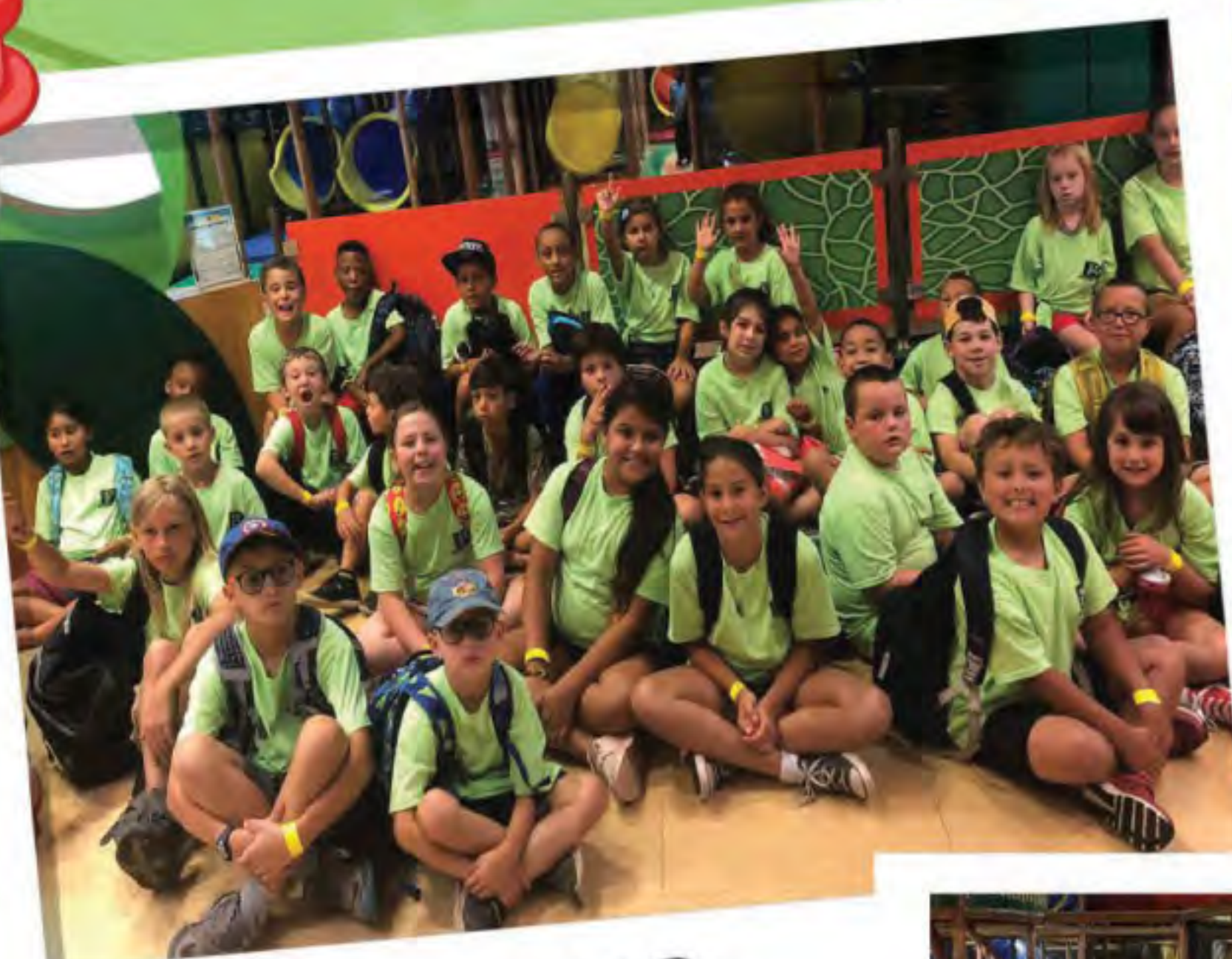
FIELD TRIP SUMMER 2018