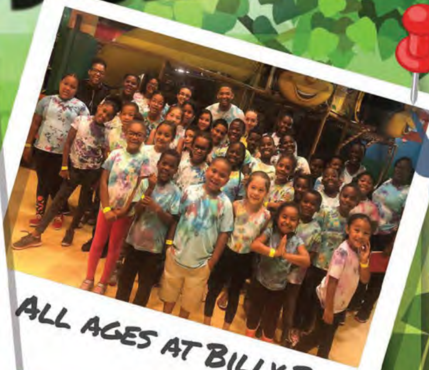
ALL AGES AT BILLY BEEZ