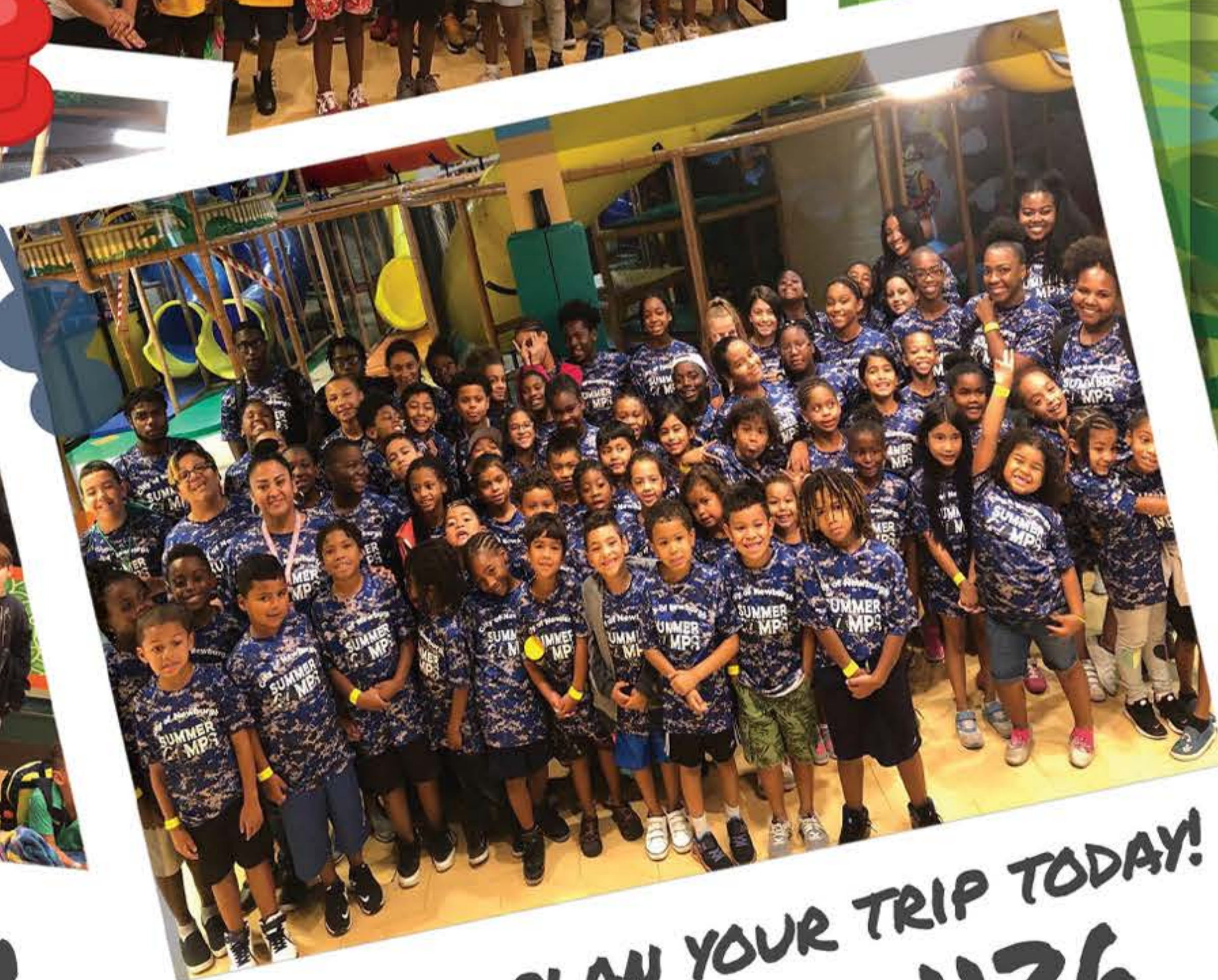
CALL TO PLAN YOUR TRIP TODAY! 347-640-1126