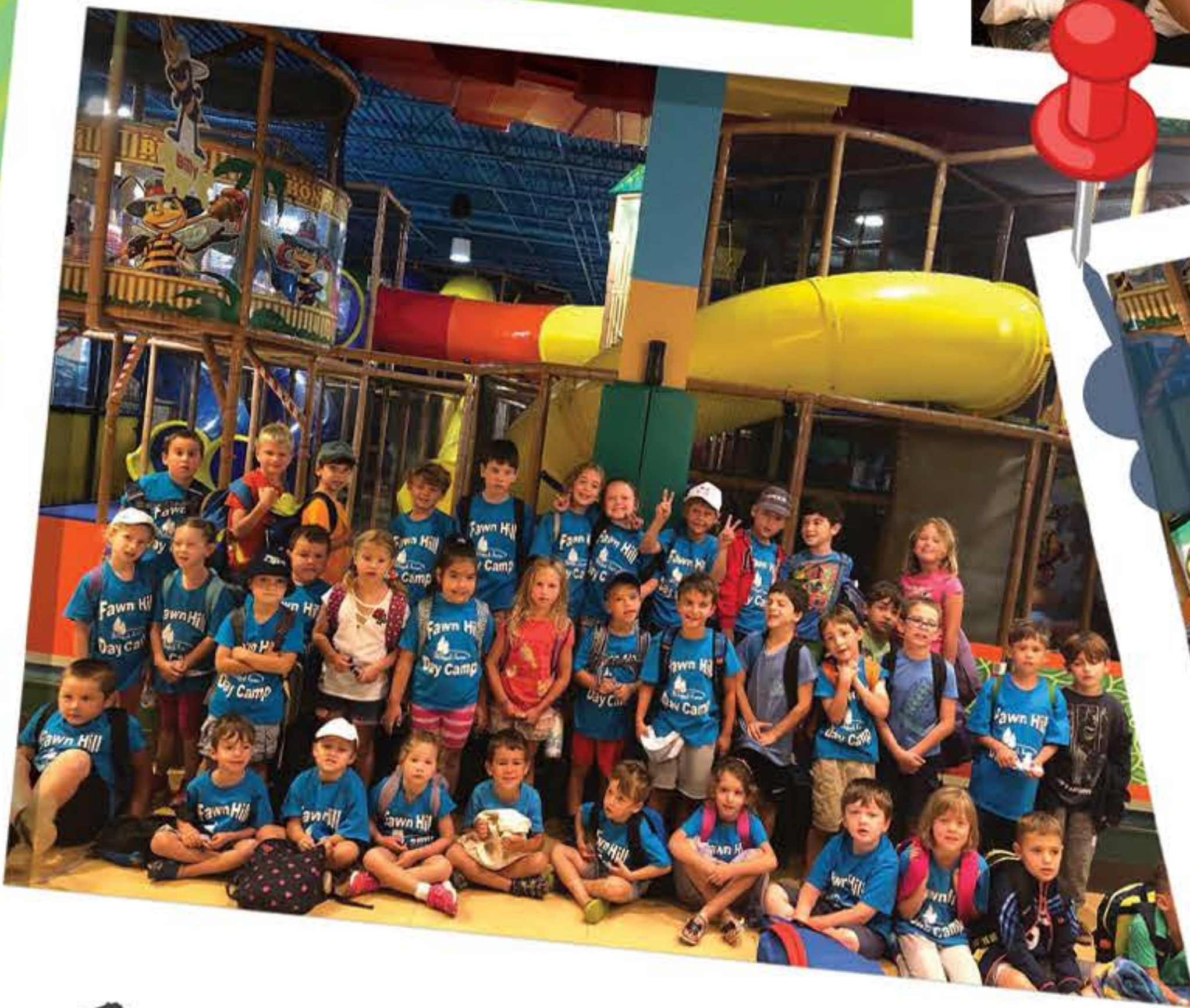
CLASS OF '18