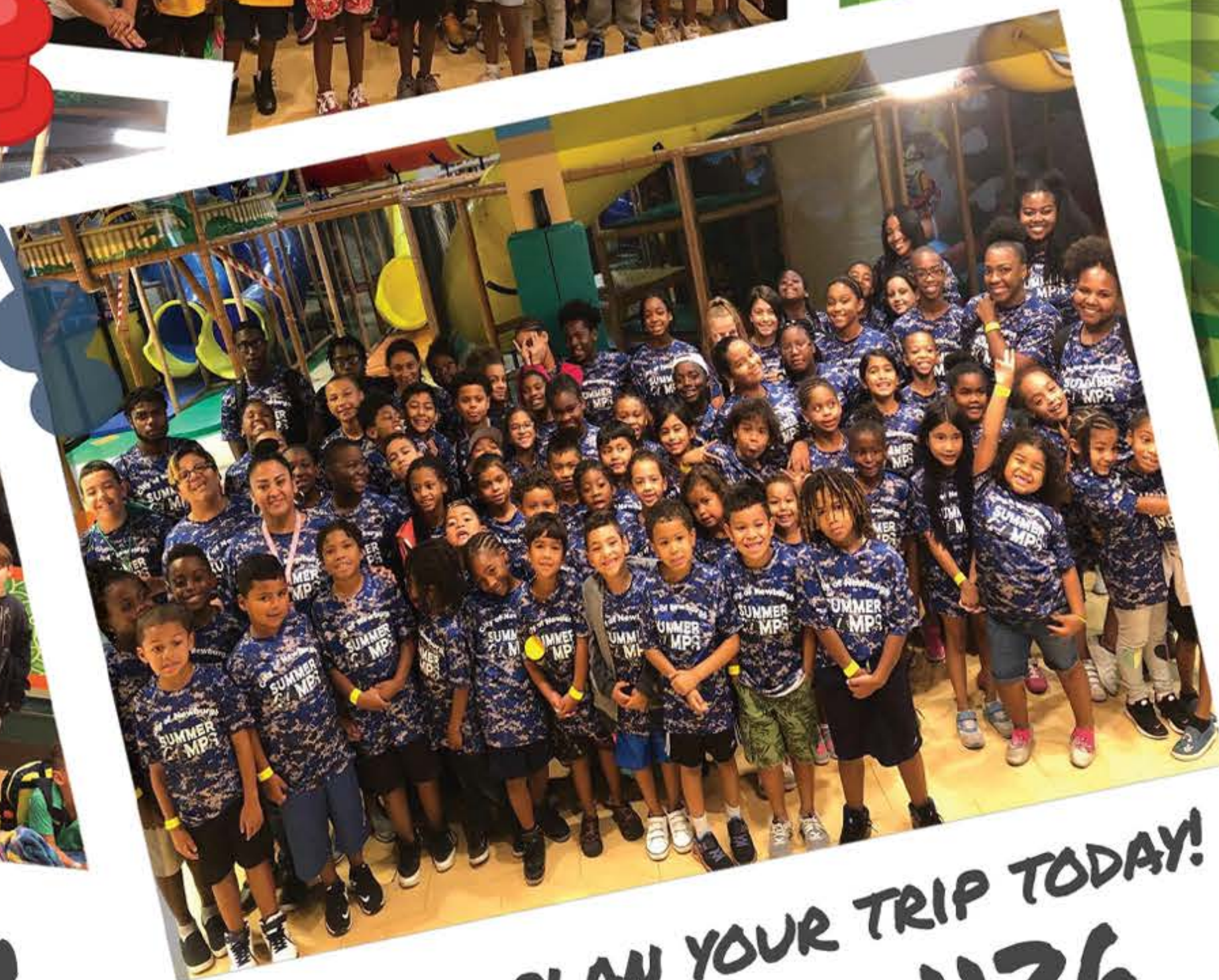
CALL TO PLAN YOUR TRIP TODAY! 347-640-1126