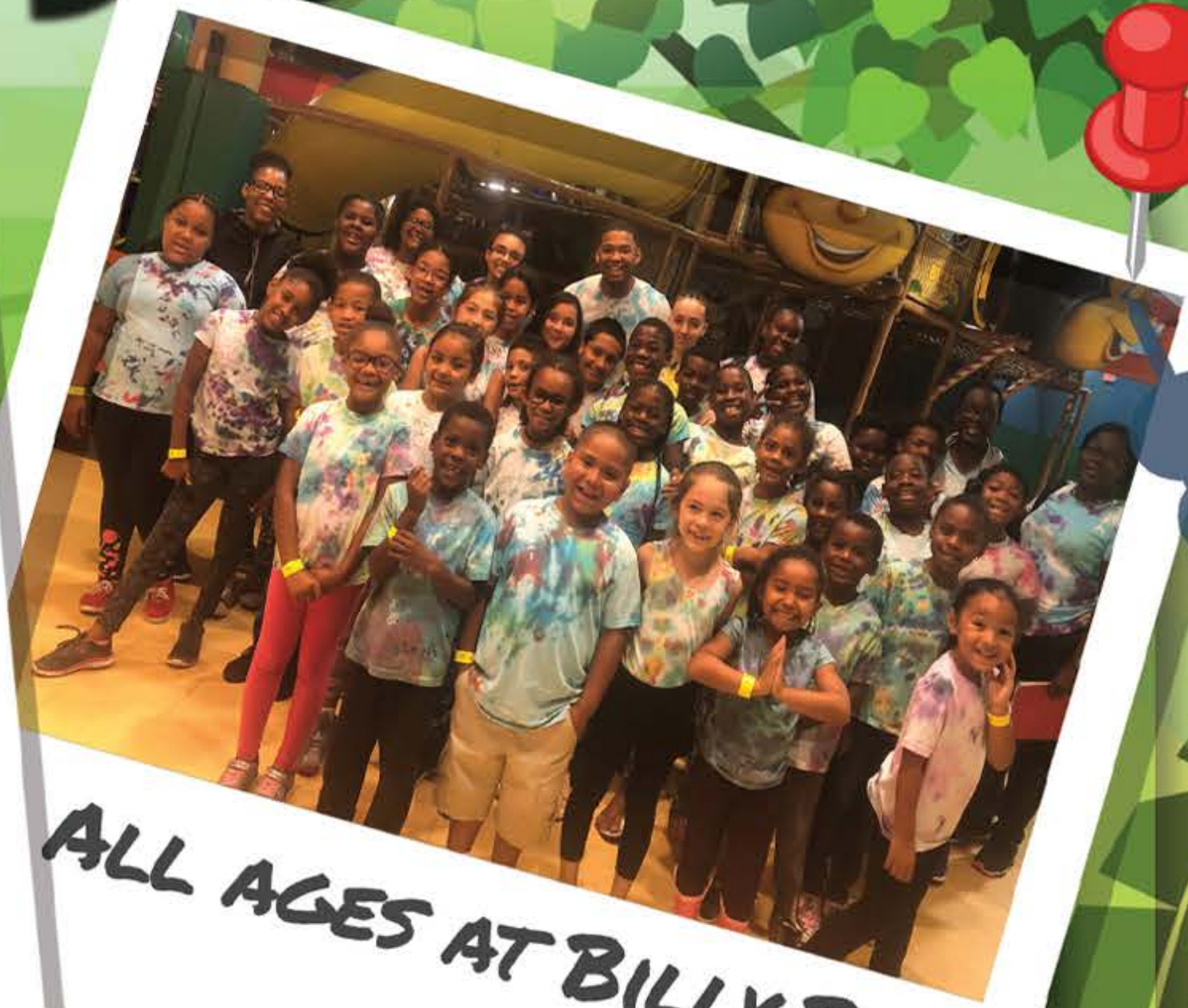
ALL AGES AT BILLY BEEZ