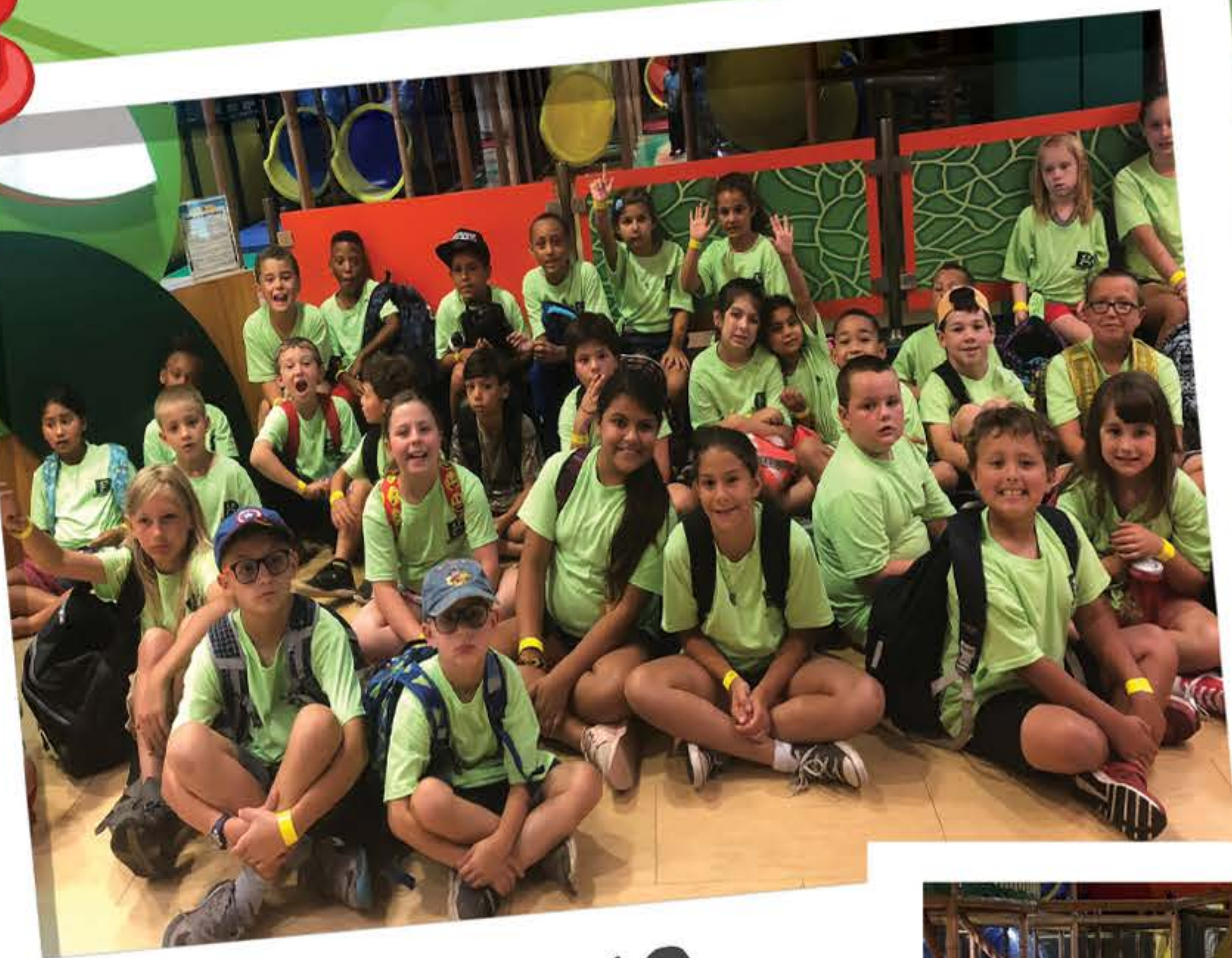
FIELD TRIP SUMMER 2018