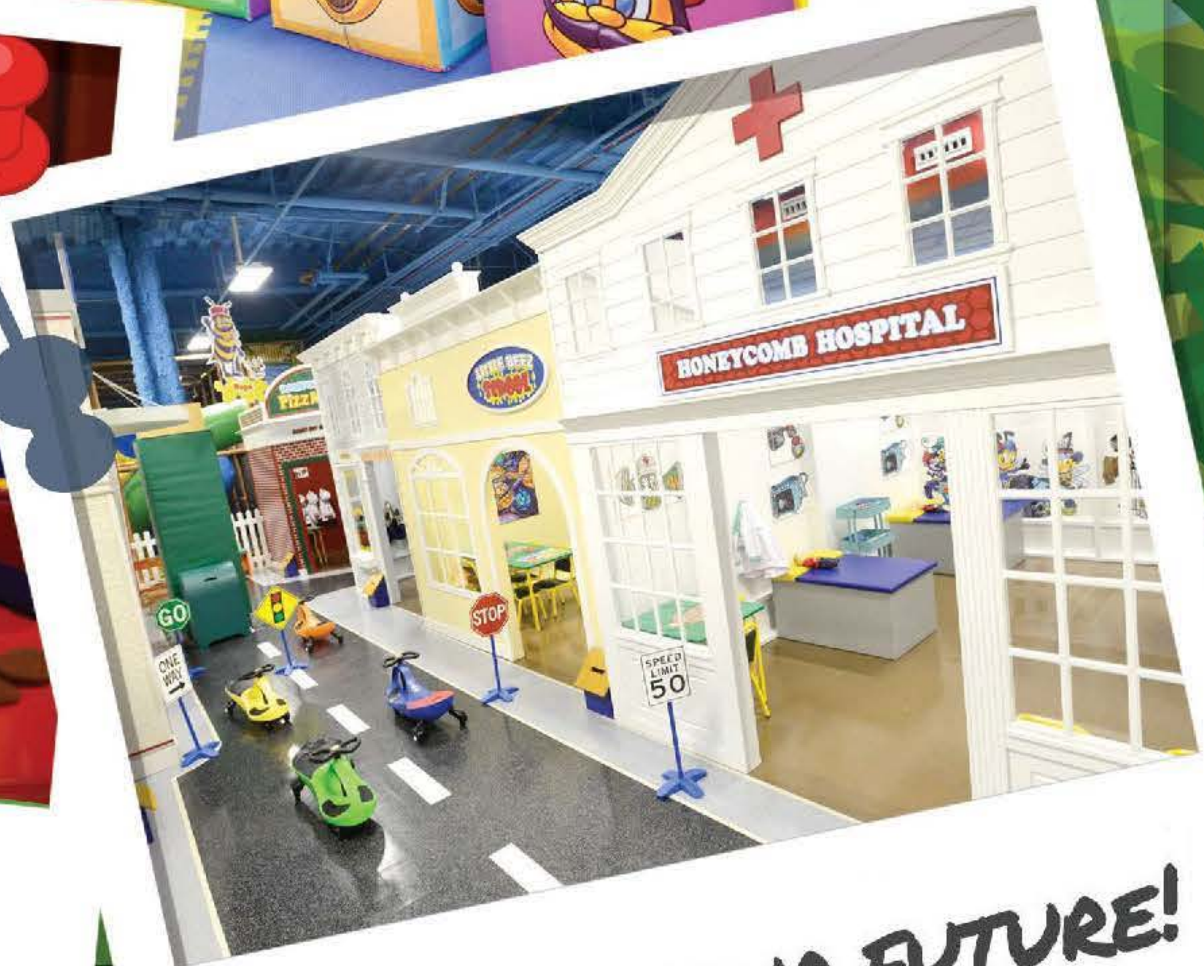
DISCOVER YOUR FUTURE!