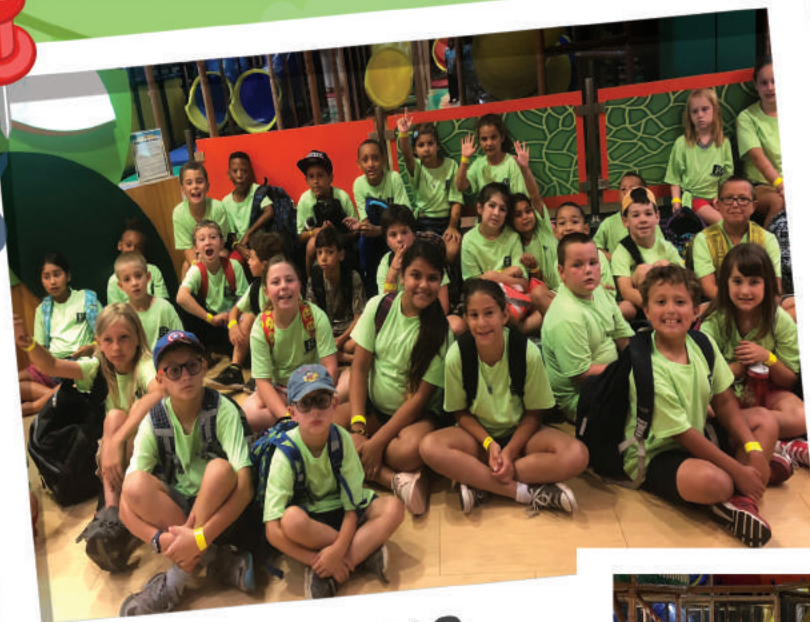
FIELD TRIP SUMMER 2018