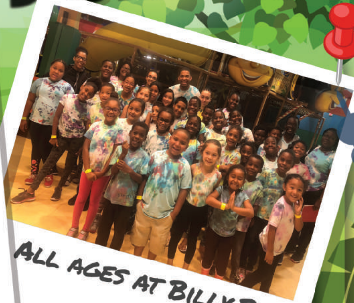
ALL AGES AT BILLY BEEZ