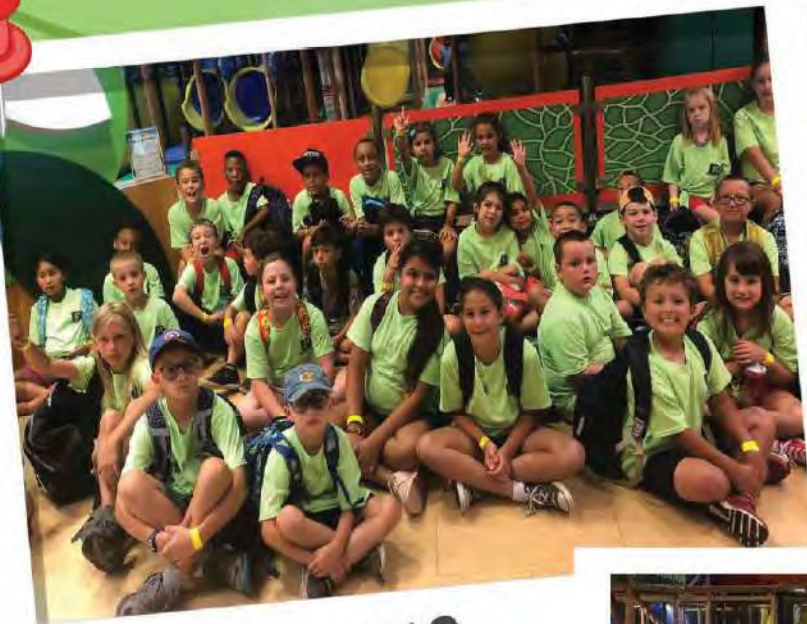
FIELD TRIP SUMMER 2018