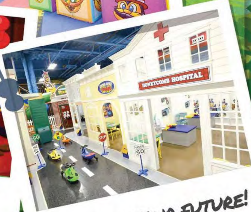
DISCOVER YOUR FUTURE!