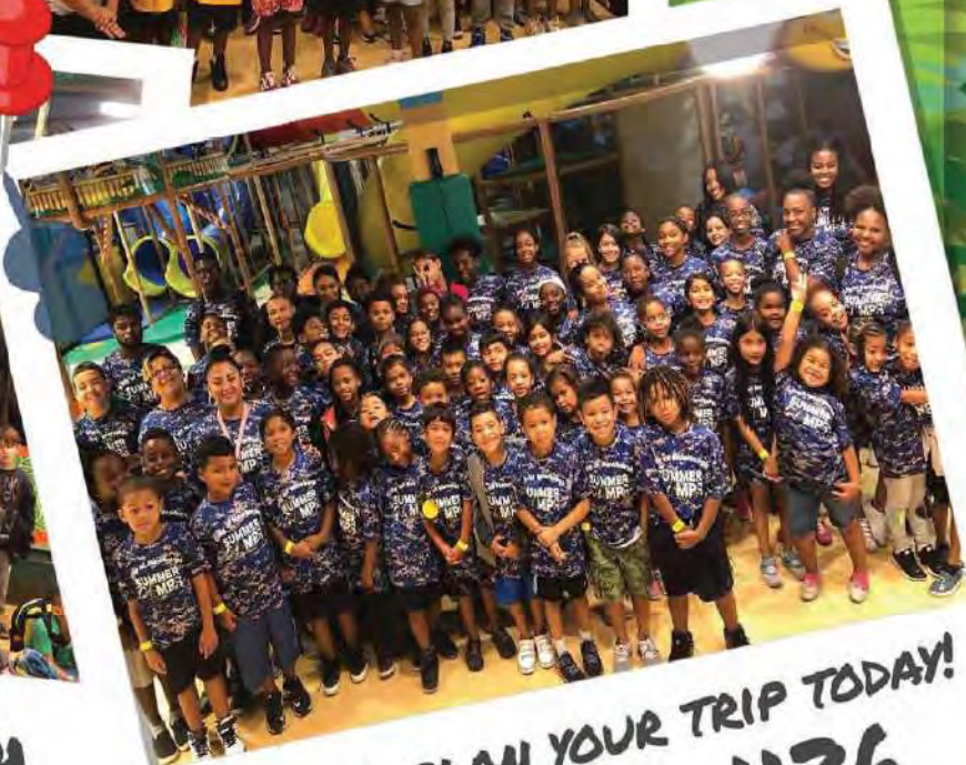
CALL TO PLAN YOUR TRIP TODAY! 347-640-1126