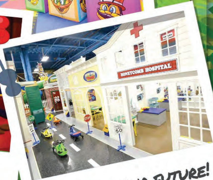
DISCOVER YOUR FUTURE!