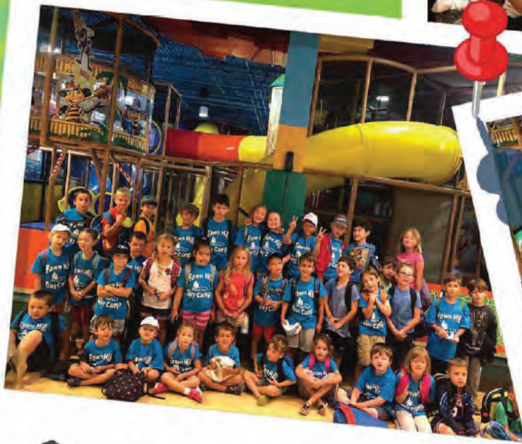
CLASS OF '18