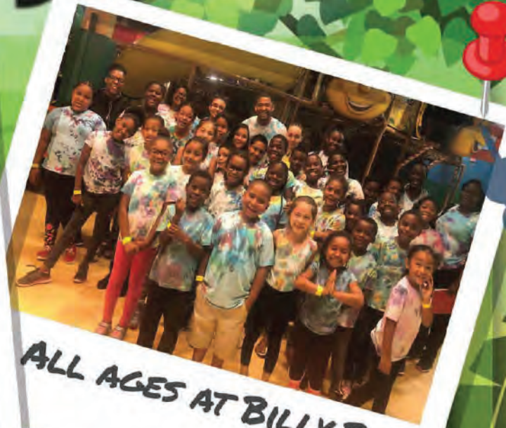
ALL AGES AT BILLY BEEZ