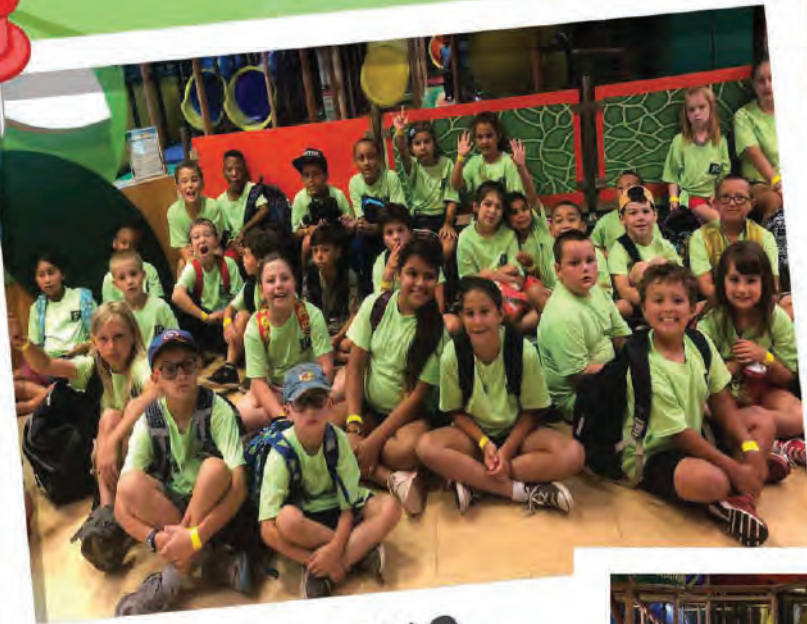
FIELD TRIP SUMMER 2018