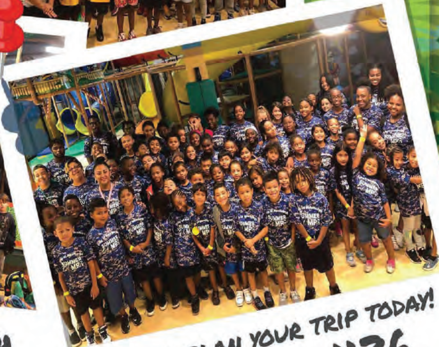
CALL TO PLAN YOUR TRIP TODAY! 347-640-1126