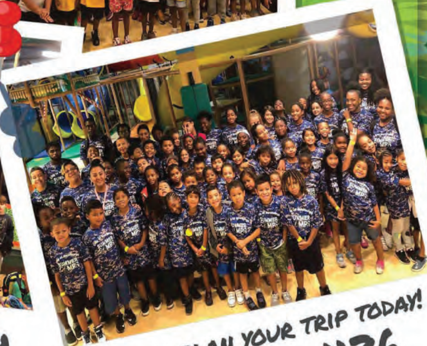
CALL TO PLAN YOUR TRIP TODAY! 347-640-1126