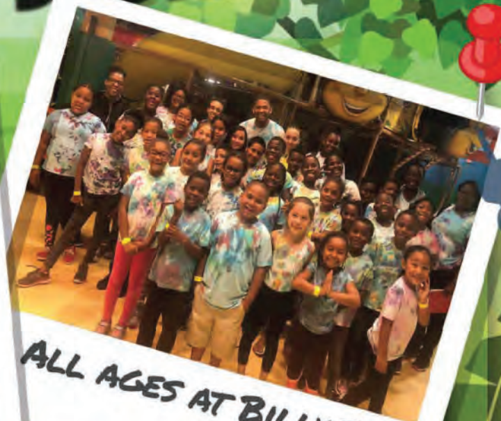
ALL AGES AT BILLY BEEZ