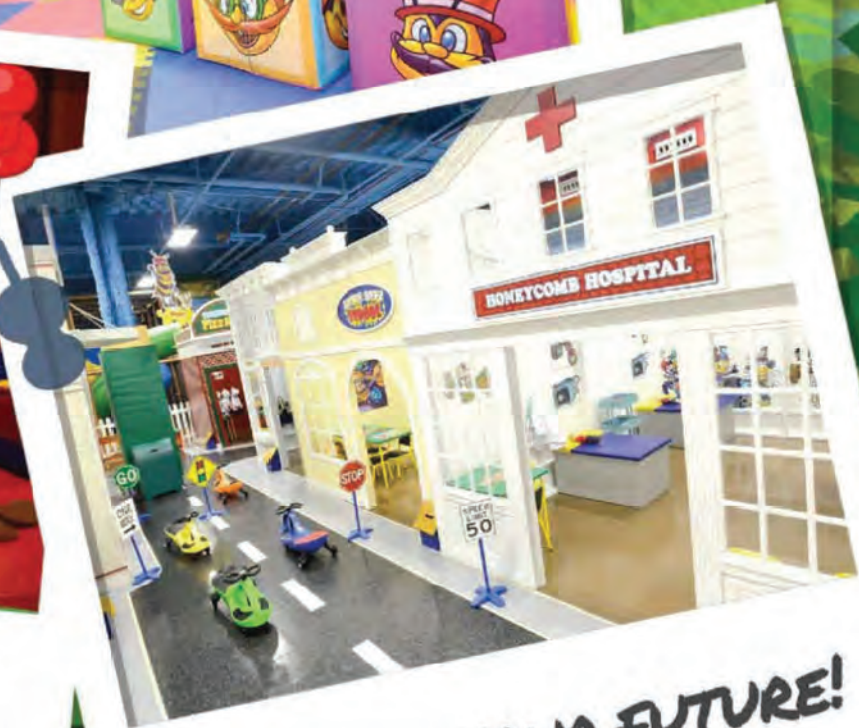
DISCOVER YOUR FUTURE!