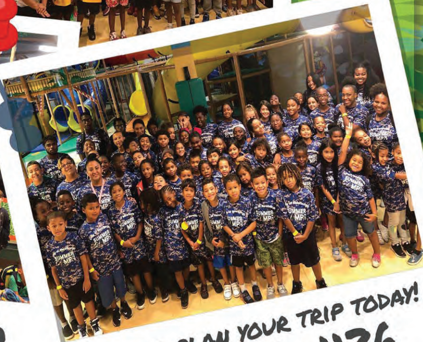
CALL TO PLAN YOUR TRIP TODAY! 347-640-1126