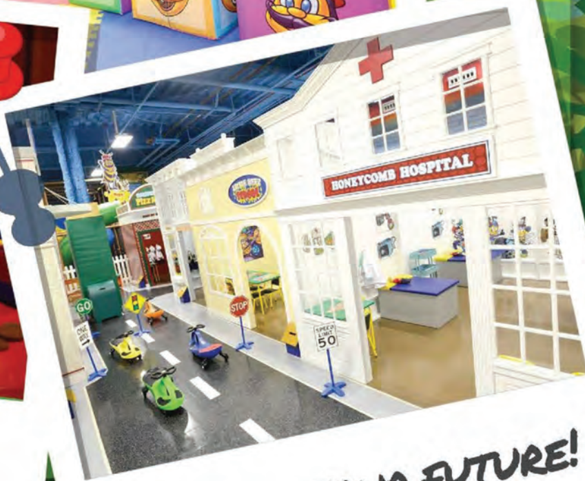
DISCOVER YOUR FUTURE!