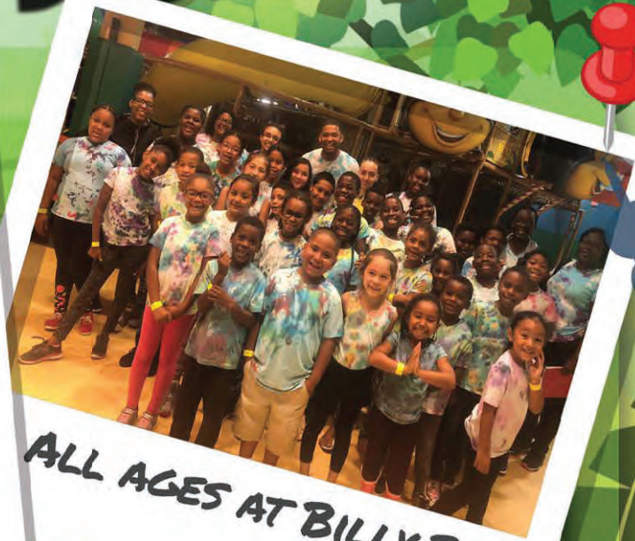
ALL AGES AT BILLY BEEZ